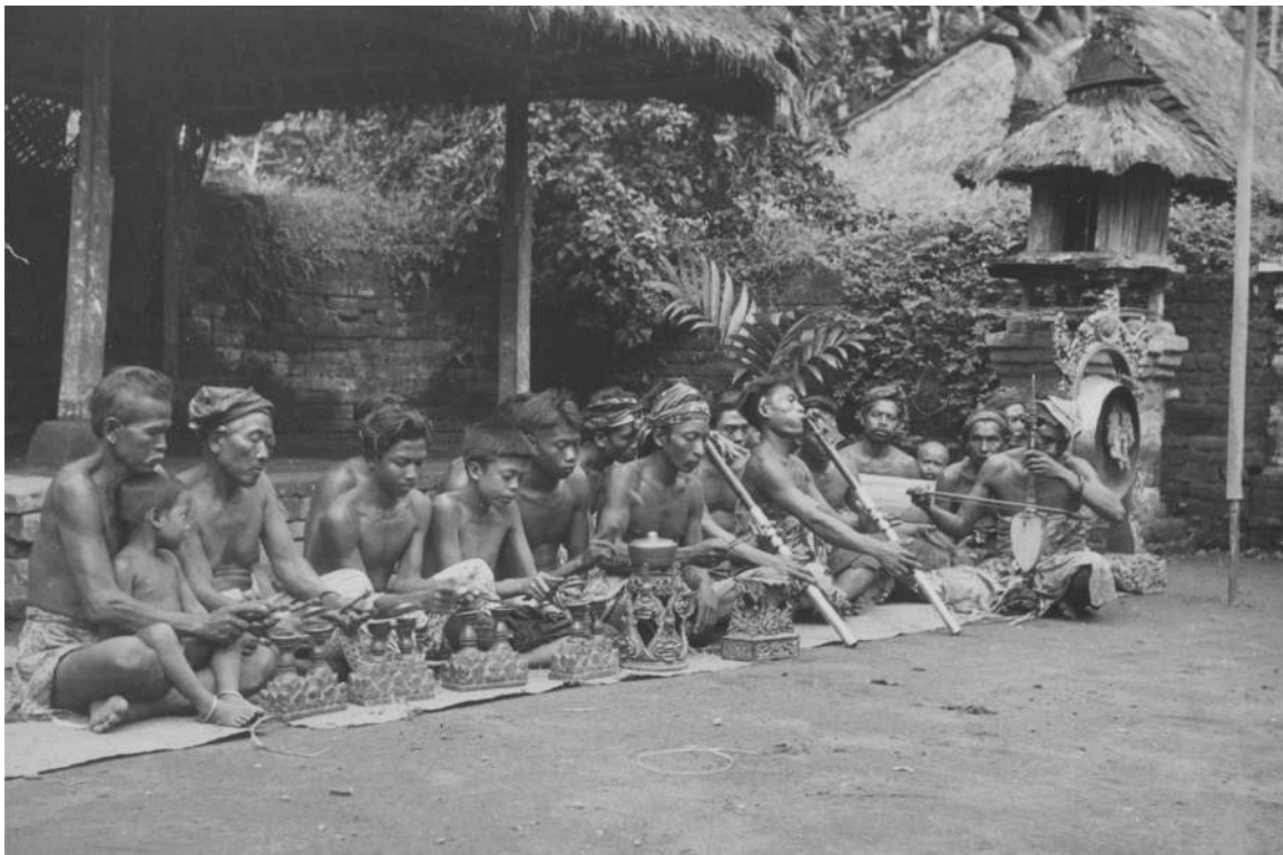
Gamelan gambuh of Sésétan Four sets of rincik, kelenang, kenyer, two suling, kendang, rebab & kempur

Lord Kresna speaks to Yudhistira, also known as Prabu Dharmaputra and Dharmawangsa, concerning the power of King Salia, cousin to the Pandawa clan but obliged to fight on behalf of their enemy cousins. Kresna means to inspire Yudhistira to defeat Salia by telling him to take stock of all the multitudes on the Pandawa side killed by Salia.