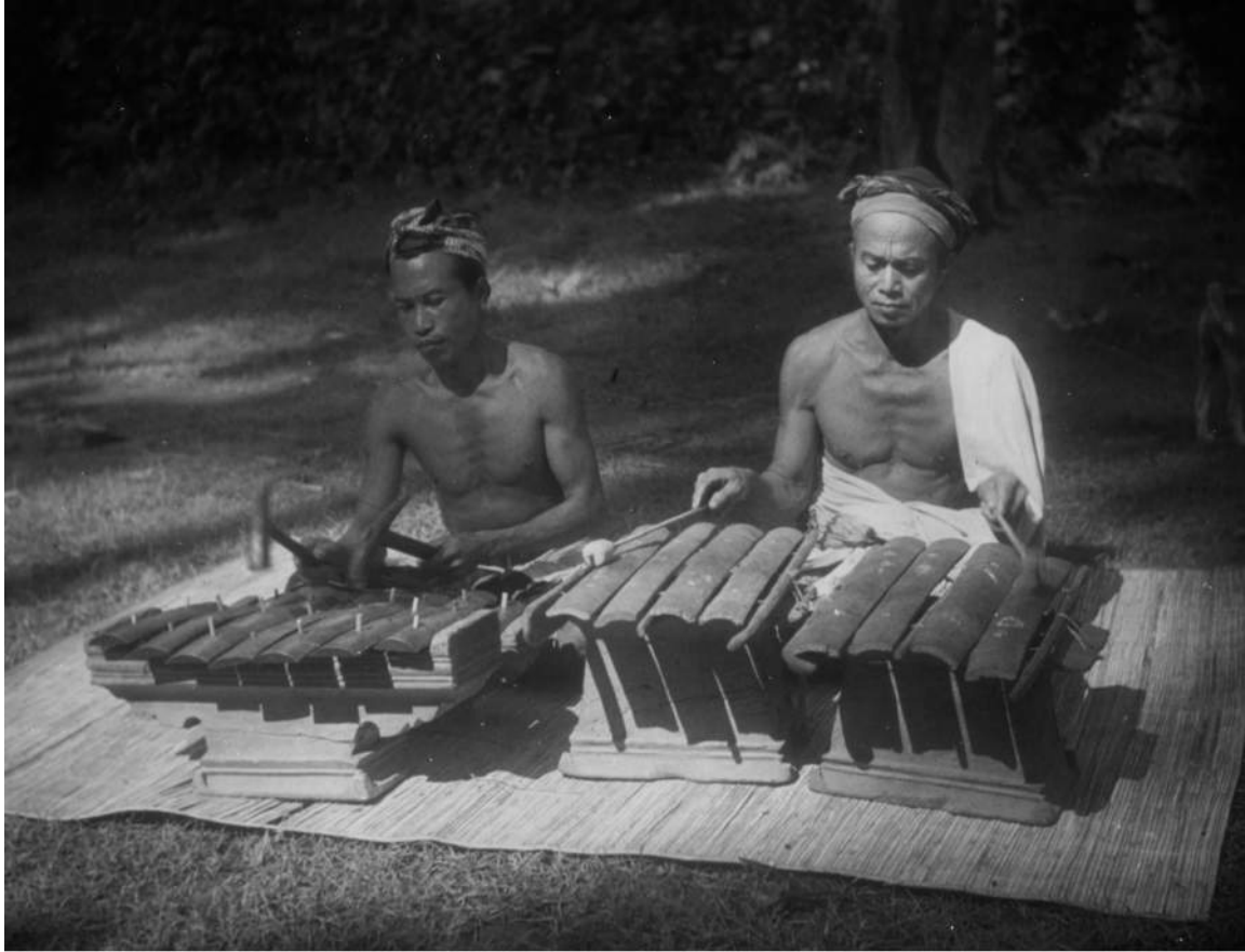
Caruk ensemble in Selat, Karangasem played for temple festivals & death rituals: saron gedé , saron cenik , & caruk (producing 7-tone scale plus the octave)