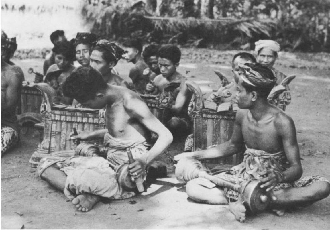
Réyong klénténg in gamelan angklung kléntangan