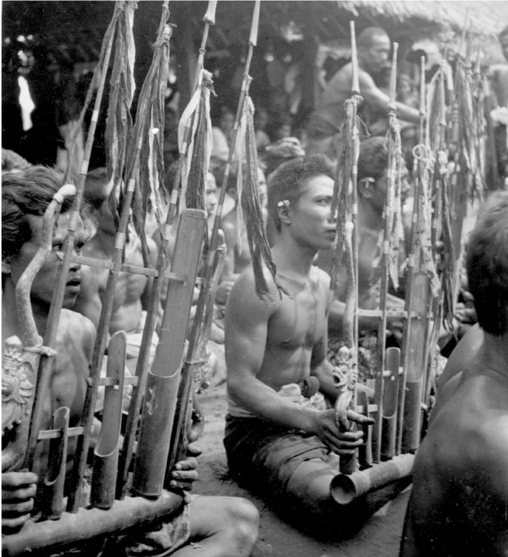
Bamboo angklung kocok of Culik, Karangasem

is interesting how suling are given freedom to deviate from fixed pitches. However, the suling on this rendition goes beyond the norm into the realm of béro , which in vocal music is often prized and appreciated as a display of subtlety when performed with that intention. It is more likely the suling player did not bring his regular flute to the recording session and took a while to adjust to the tuning of the gamelan .