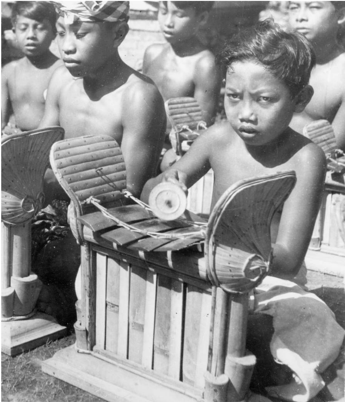
Gamelan angklung of Sayan Kayun playing the pemadé with gendér mallet