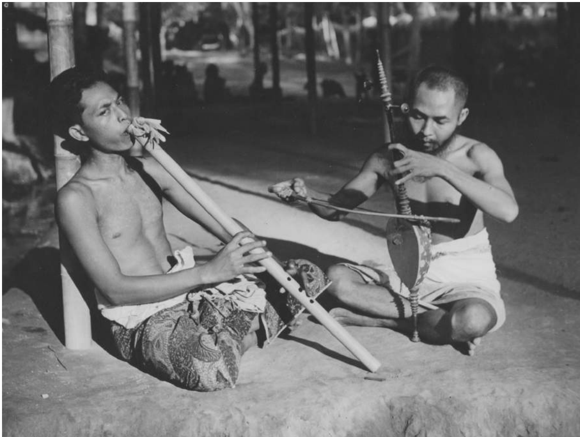
Suling gambuh & rebab in Batuan

Prabangsa: Énak-énak pukulun, énak! All right, Your Honor, all right!