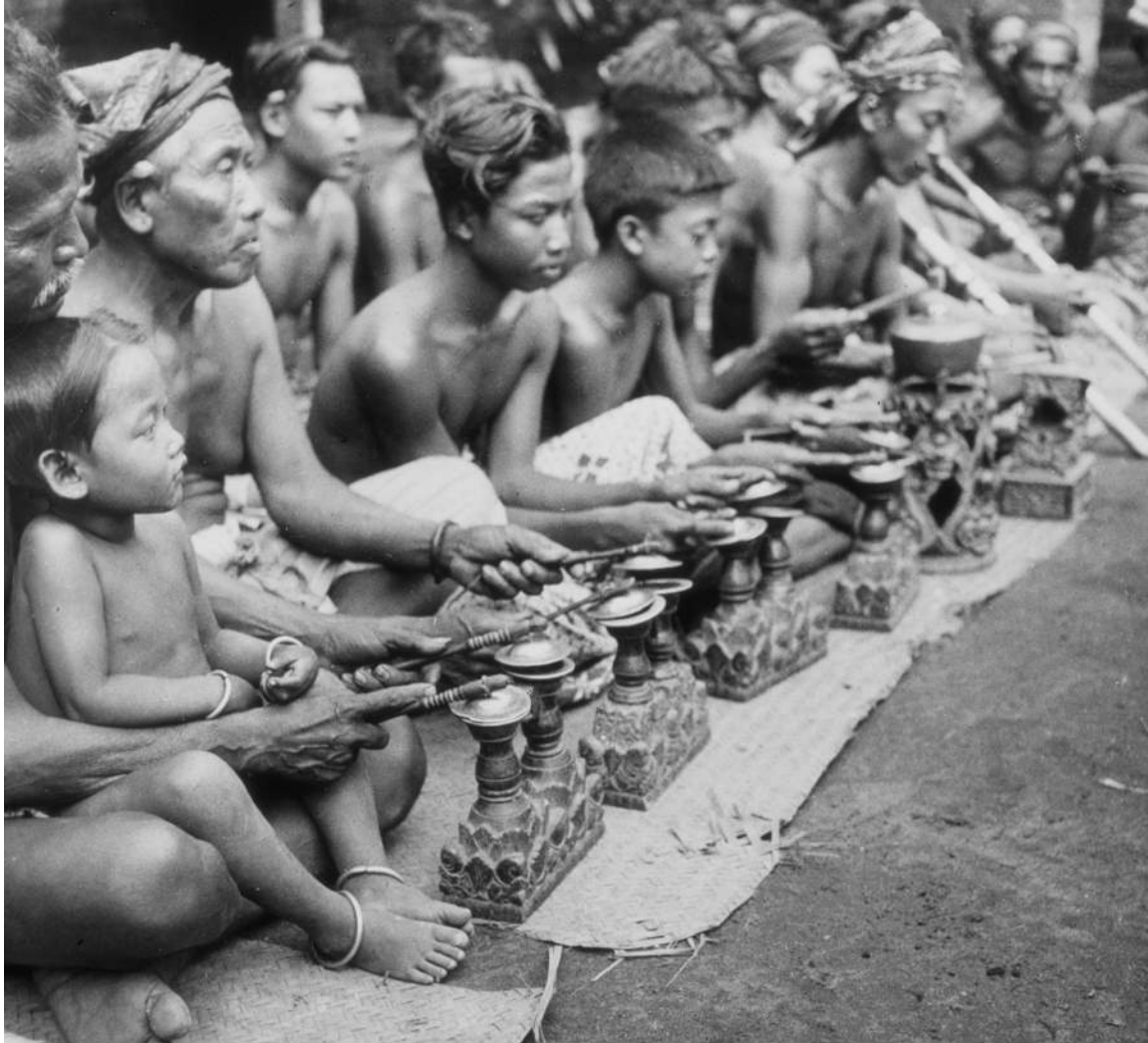
Gamelan gambuh of Sésétan Four sets of rincik , kelenang , & two suling circa 1931-38