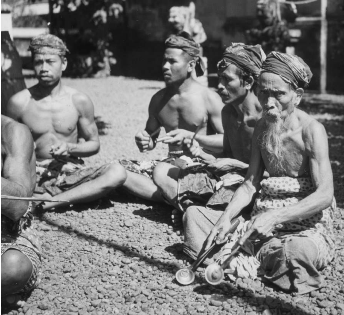
Kangsi and gumanak in the gamelan gambuh of Puri Tabanan