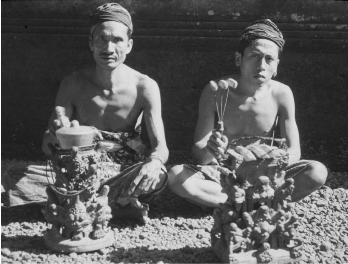
Kelenang and kenyer in the gamelan gambuh of Puri Tabanan