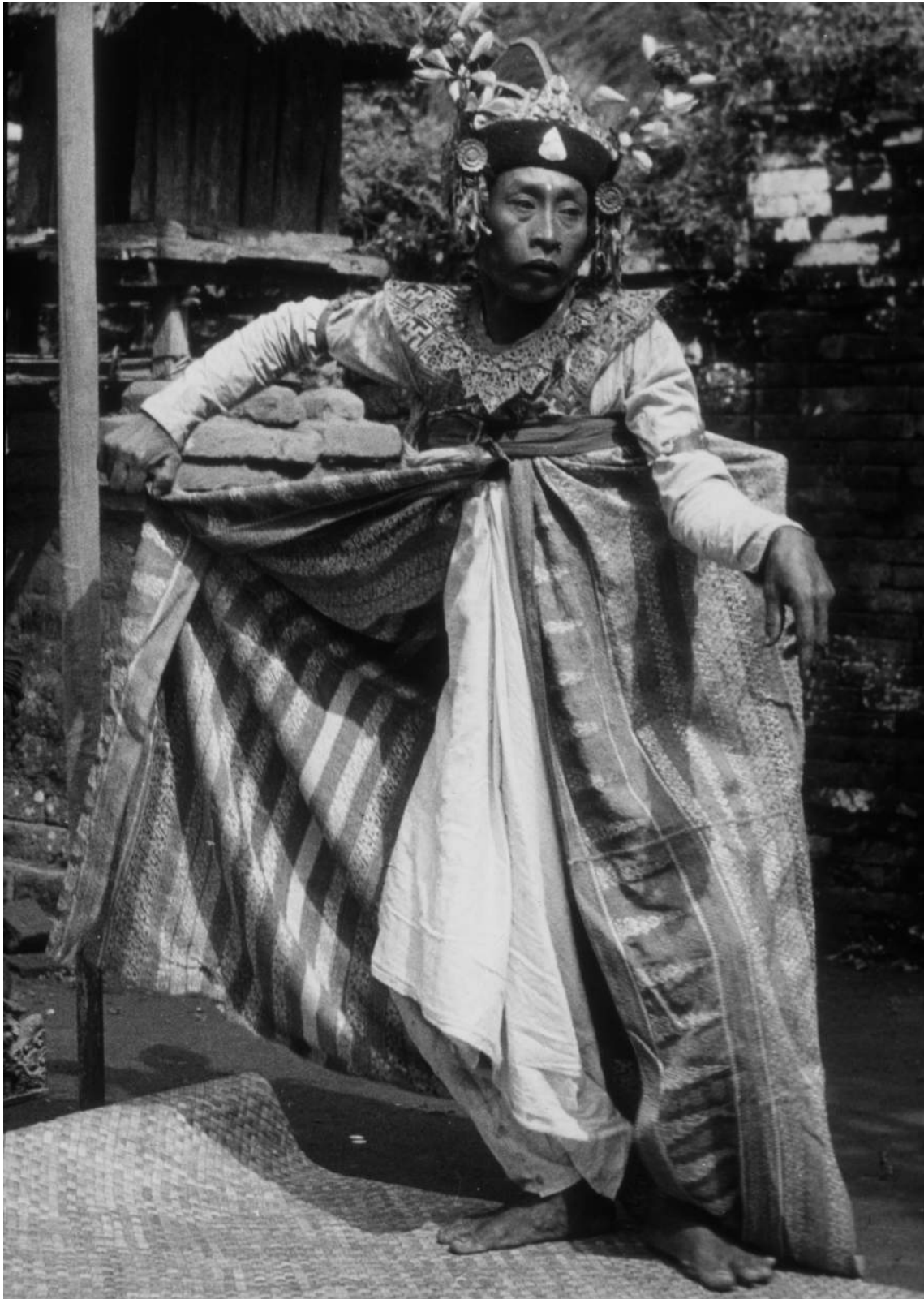
Gambuh of Sésétan; Rangga/Patih Tua (old minister)