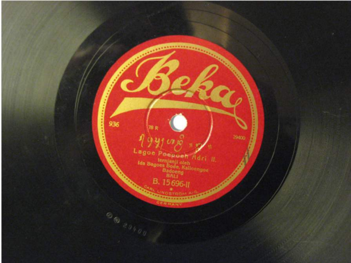
Original 78 rpm record from the historical recordings of 1928-29 with information on the label printed in Balinese script. This particular record contains Pupuh Adri and is the only existing disc in the world.

Visit www.arbiterrecords.org or www.bali1928.net for more information