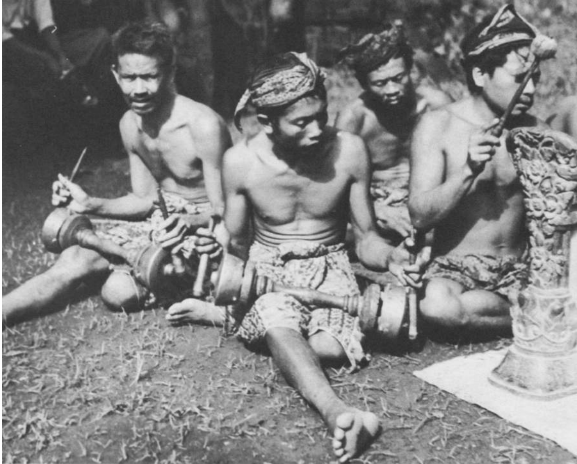
Réyong klénténg in gamelan angklung kléntangan