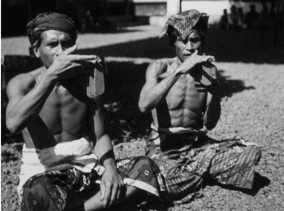
Lupita in the gamelan gambuh of Puri Tabanan