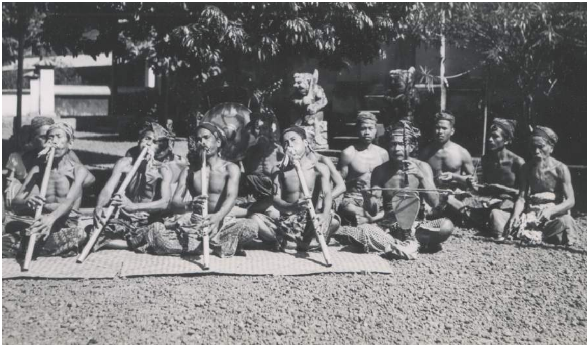
Gambuh of Puri Tabanan