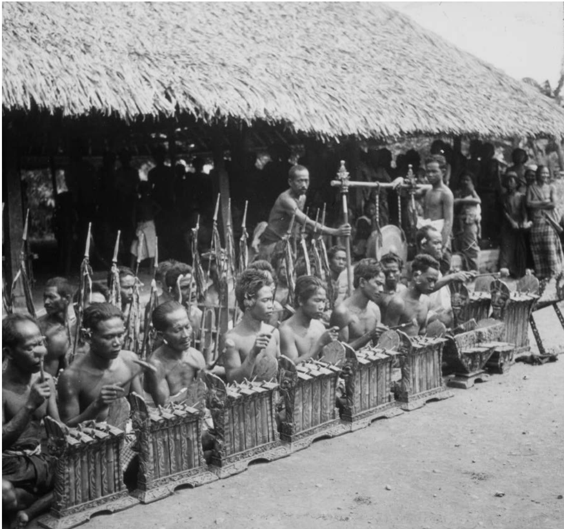
Gamelan angklung kocok of Culik, Karangasem circa 1931-38