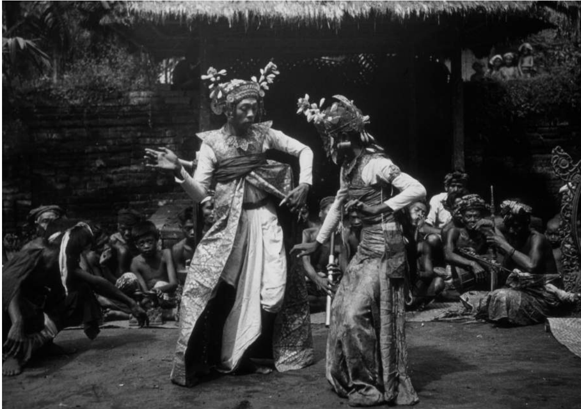
Gambuh of Sésétan; Prabu Manis (refined king), Putri (princess) & Togog (servant) on far left