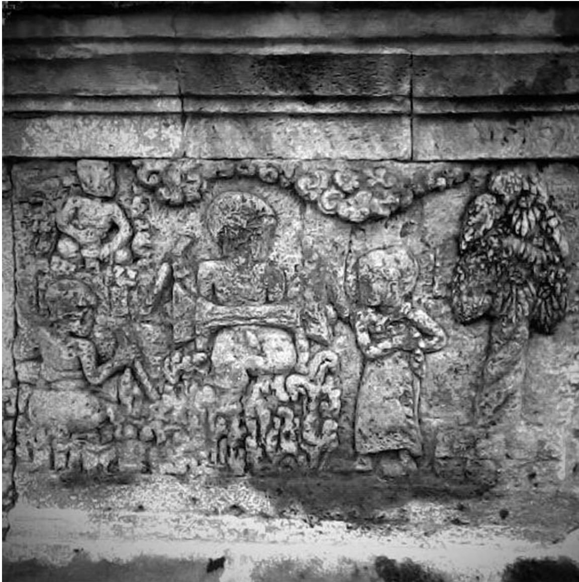
Early form of réyong depicted in stone reliefs at the East Javanese temple Candi Panataran (11 th -14 th century) Photo by Colin McPhee circa 1931-38 Courtesy of UCLA Ethnomusicology Archive & Colin McPhee Estate