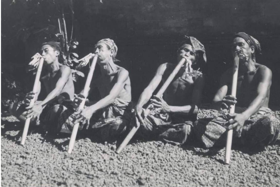
Suling gambuh of Puri Tabanan circa 1931-38