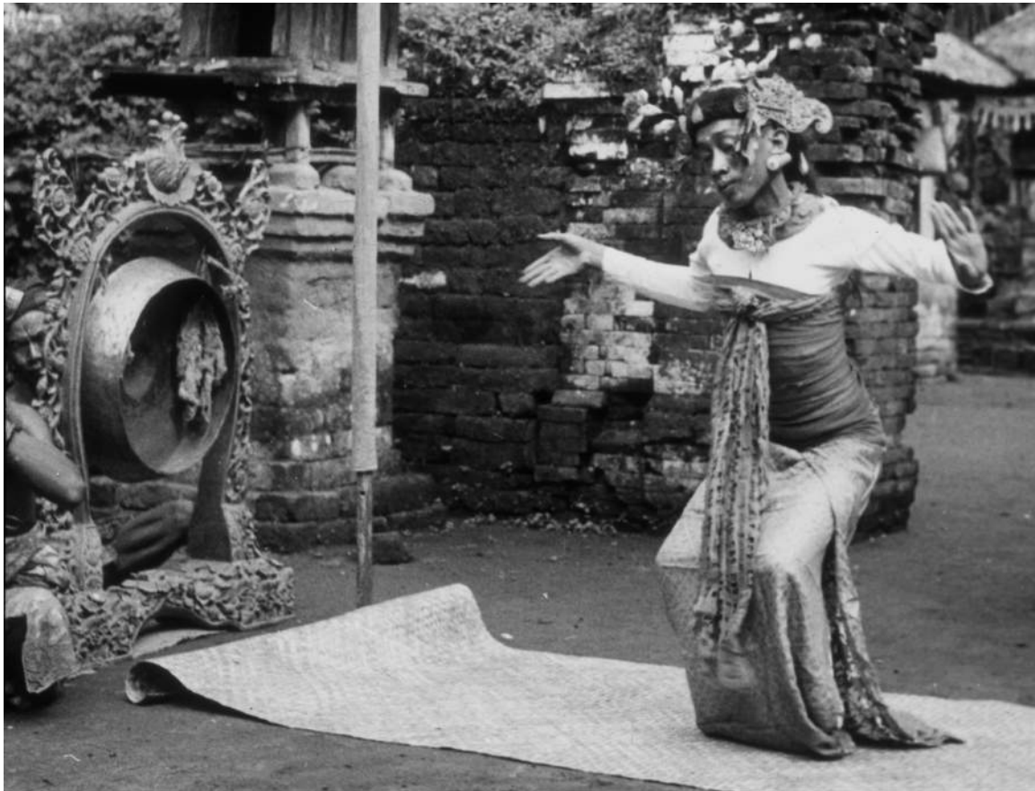
Gambuh of Sésétan; Condong (maidservant) Photo by Colin McPhee circa 1931-38 Courtesy of UCLA Ethnomusicology Archive & Colin McPhee Estate