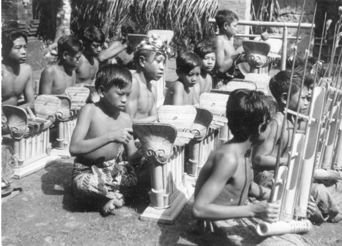
Children's angklung of Sayan, Ubud with bamboo angklung kocok circa 1931-38